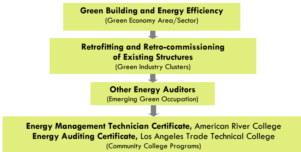
Figure 2: Occupational Program Development Utilizing the Green Economy Framework

This information can provide a starting point for program modification and new program planning. This type of evaluation and assessment will become even more important through the lens of the ARRA dollars. Significant ARRA resources have been identified for green building and energy efficiency. Figure 2 provides an example of how the framework might be applied starting with Green Building and Energy Efficiency as the major green industry sector and culminating in new community college programs to meet specific industry needs.